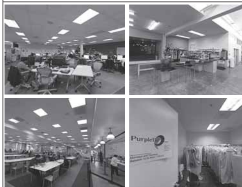
Exhibit IV: Images of Facebook Office